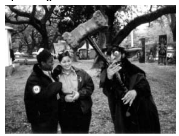
house, car washes, and pancake breakfasts. Activities include weekly meetings and training sessions, participation at drill fires, fire prevention

The program was established in 1981. It normally has approximately 20 members; a dozen or so have gone on to become firefighters in departments throughout Washington, Idaho, and Alaska. Members pay nominal dues, and other funds are obtained through donations from community organizations, and by operating a Halloween haunted