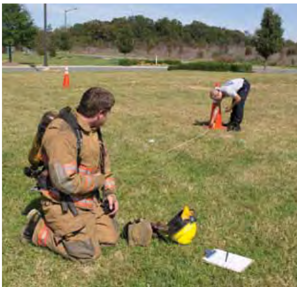
Setting up the cones for the Cone Test (photo courtesy of Ilya Margolis).