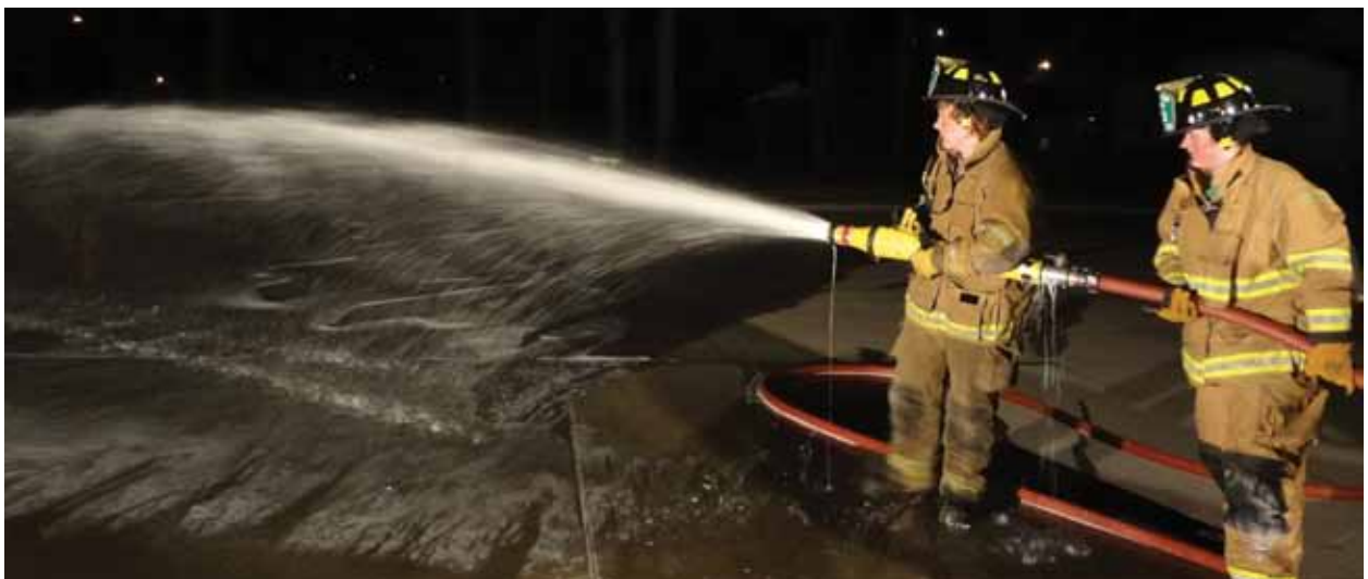
Junior firefighters practice using foam as a fire suppressant at the Cherryville Fire Department.