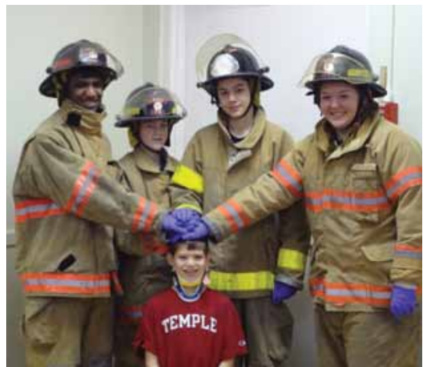
Westhampton Beach junior firefighters with their rescued "victim."