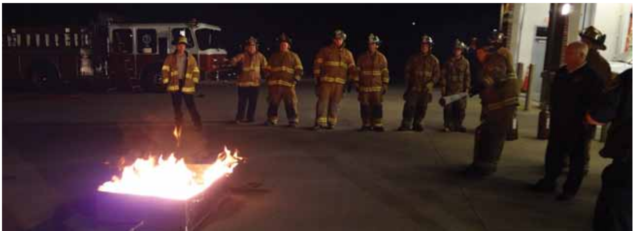
Cherryville junior firefighter practice using fire extinguishers to put out a controlled fire.

Review lesson and then utilize information learned to practice with fire extinguishers.