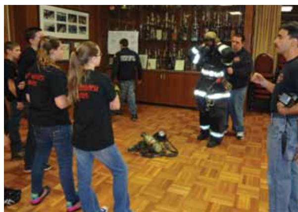
Junior firefighters don gear in a drill at the East Norwich Fire Company.