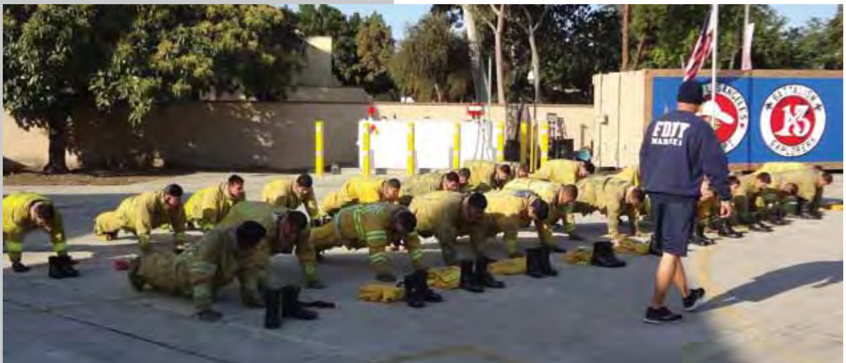
L.A. County Fire Department Explorers working out before training.