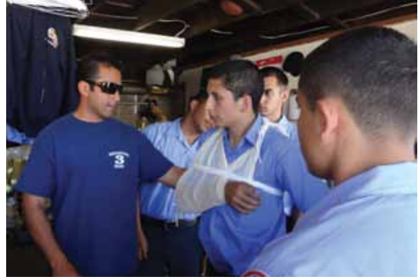
Los Angeles County Fire Department program advisor teaches basic first aid to junior firefighters.