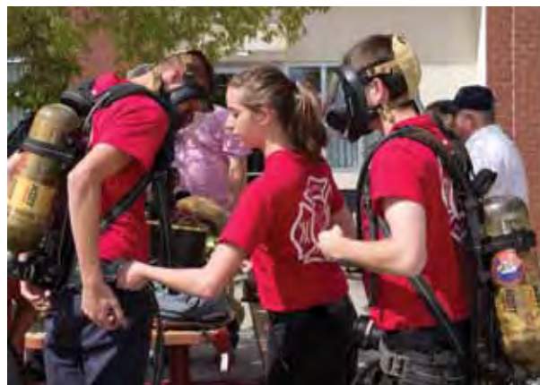
Junior firefighters don gear at the NVFC National Junior Firefighter Academy at Scott Safety.

Review the various pieces of personal protective equipment, proper donning, and how to use an SCBA.