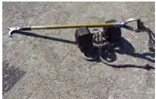
Tie a pike pull to a weight, then simulate picking at a ceiling to work on arm strength.

Youth are impressionable. The ideas, behaviors, and skills they learn now will stay with them through life. With heart attack the leading cause of on-duty firefighter fatalities, it is critical to emphasize physical fitness as part of a firefighter's duty. The body is the most important tool a firefighter has at his or her disposal, and without proper training, they will not be ready for the next call. In addition, proper training will help reduce the number of firefighter injuries. The NVFC's Heart-Healthy Firefighter Program ( www.healthy-firefighter.org ) and other health and safety initiatives ( www.nvfc.org ) provide tools, resources, and training on nutrition, fitness, and vehicle safety, among other health and safety topics. Consider implementing a workout component in your regular trainings and take time to emphasize the importance of a healthy and safe lifestyle.