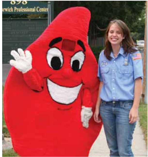
Junior firefighters can educate the community about fire safety and prevention (photo courtesy of the East Norwich Fire Company).

In addition to the smoke house, the Great Neck juniors staff a booth and hand out fire prevention and safety information during the Street Fair. They demonstrate different firefighting and rescue tools to show how first responders do their jobs. Visitors can also take a tour of one of Great Neck's fire trucks.