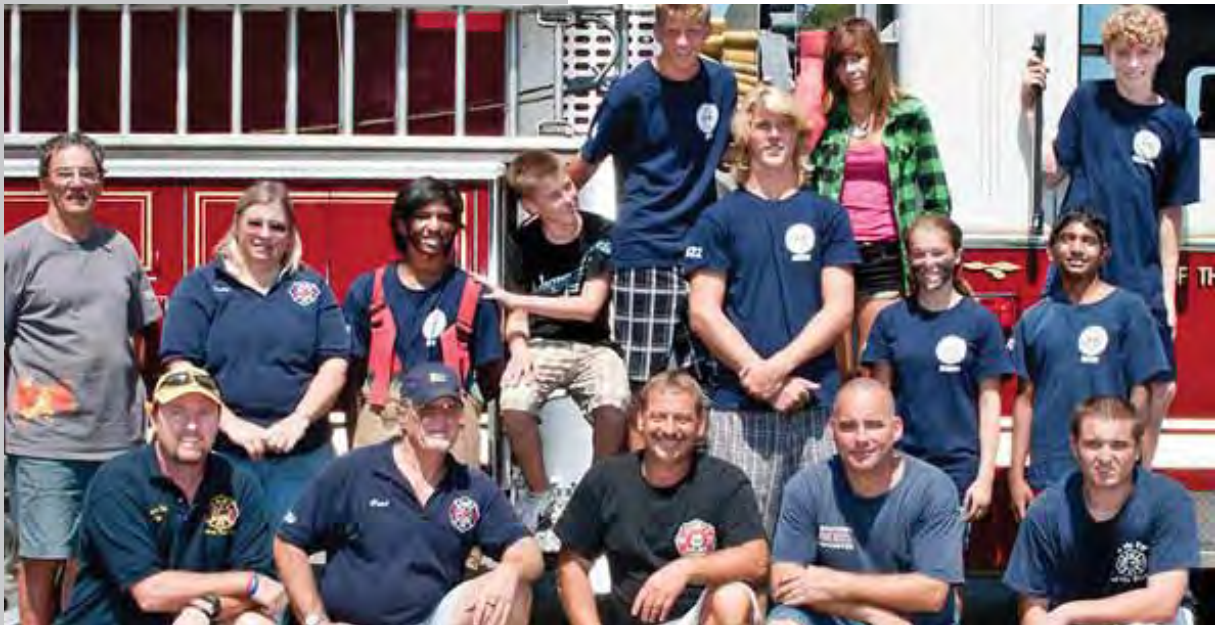
Westhampton Beach junior firefighters provide a safe haven for bullied teens.

Teach juniors about the organizational system of your fire department. Invite department leadership to speak about their path to their current position. Emphasize respect for leadership, working with the team, and acting in the best interests of the department and for the job at hand. Teach juniors about duties firefighters/EMTs perform when not on call, and have them contribute to cleaning, cooking, and other chores around the station.