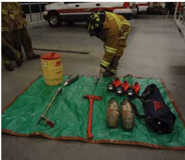
Cherryville Fire Department junior firefighters set up equipment on a tarp.

Review steps 1-4 above, walking through how to complete each task. Once juniors are familiar with the process, time groups of juniors on setting up a tarp, adding time for any forgotten equipment or incorrectly placed items.