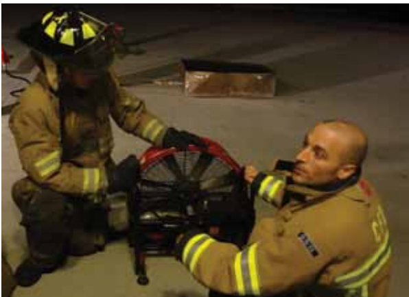
Cherryville Fire Department program advisor leads a drill on using fans for ventilation.