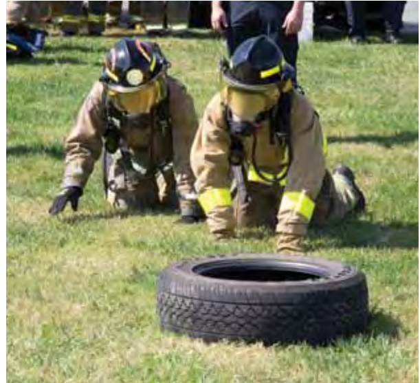
Junior firefighters practice the tire drill at the NVFC National Junior Firefighter Academy at Scott Safety.