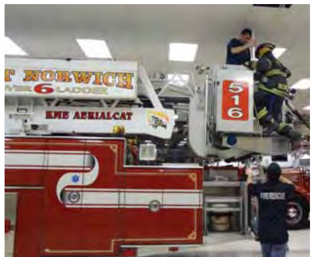
East Norwich Fire Company junior firefighters practice a bailout system drill.