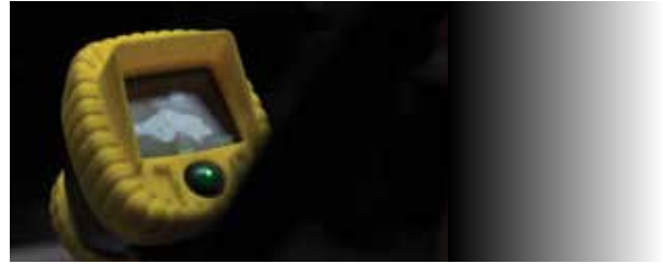
Junior firefighter uses thermal imaging camera to find a heat source at the NVFC National Junior Firefighter Academy at Scott Safety.