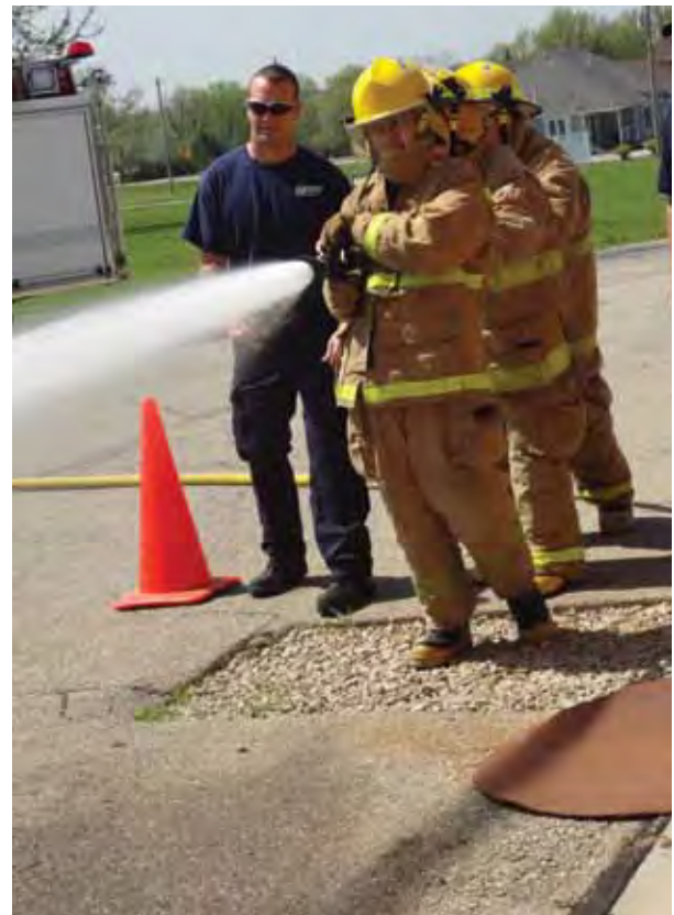
Solider Township Fire Department junior firefighters use cones to simulate a multi-story fire.